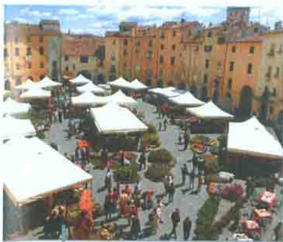
Piazza Anfiteatro in Lucca